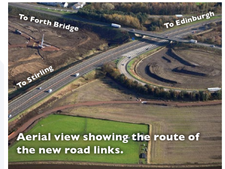
Aerial view showing the route of the new road links.

Over the last four months, a new site compound has been created outside Kirkliston, on the B9080, to accommodate staff and plant adjacent to the road works. Extensive earthworks and vegetation clearance have been completed so that work can start in earnest to create the new road links and widening of the M9.