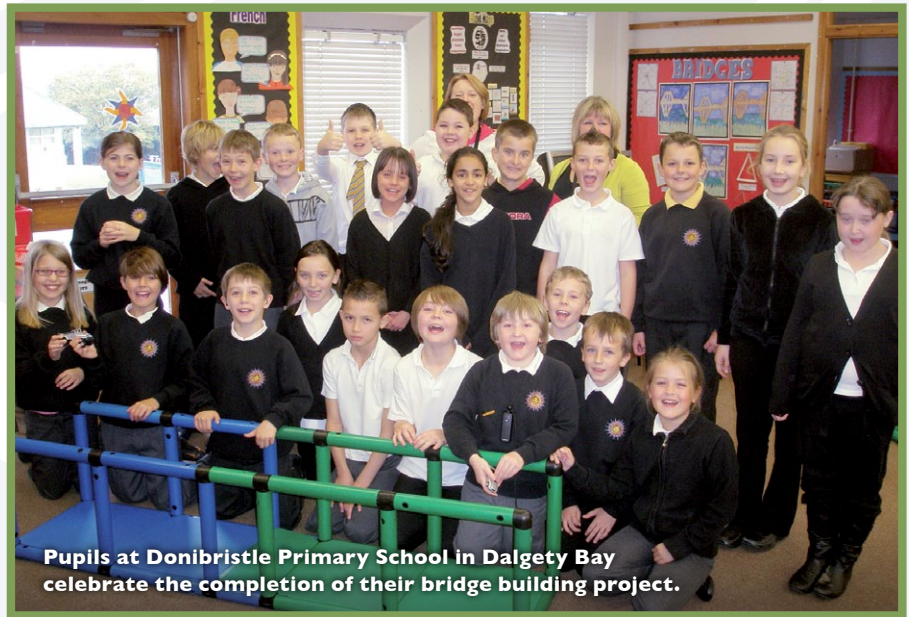
Pupils at Donibristle Primary School in Dalgety Bay celebrate the completion of their bridge building project.