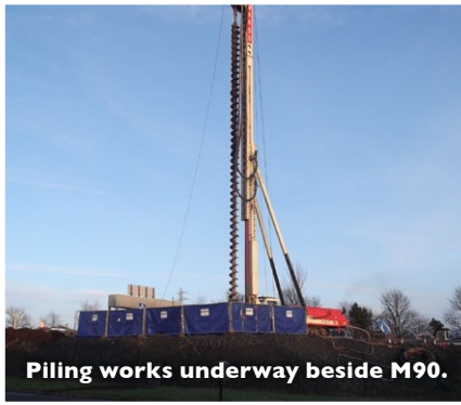
Piling works underway beside M90.