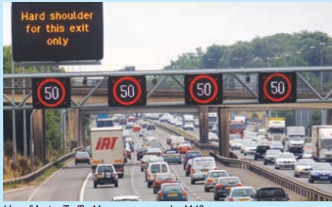
Use of Active Traffic Management on the M42.

Current road connections to the existing bridge operate satisfactorily for the majority of the day but suffer from congestion and significant queuing at peak periods. The implementation of an Intelligent Transport System is proposed from Halbeath Junction to the M9 to actively manage and improve the flow. This could include a broad spectrum of measures such as: