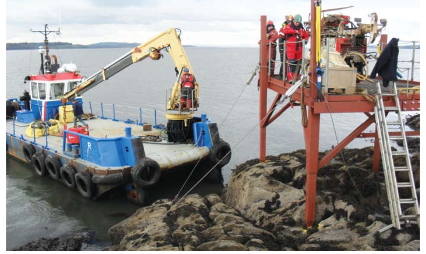
Temporary platfrom on Beamer Rock.

Soil Engineering also worked north of the Forth on a separate ground investigation on the M90 for the Fife ITS element of the scheme.