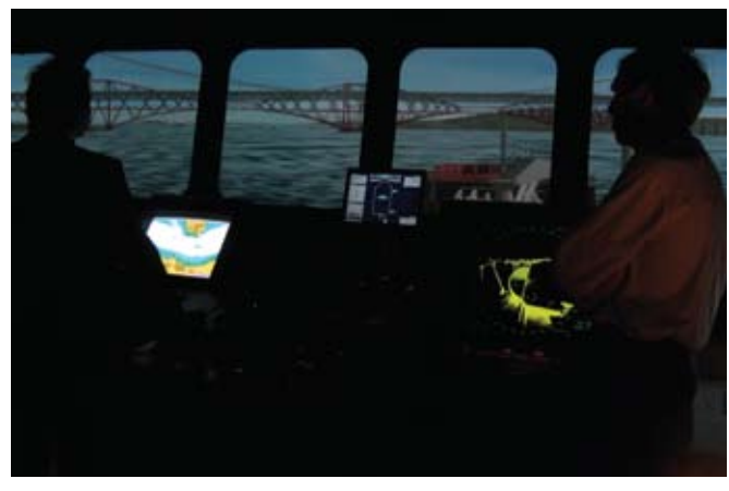
Two ship pilots take part in the FRC Main Crossing Ship Simulation Study.

"We were able to practice what will happen during the construction phase of the project, when barges will be moored in the river as the decking sections are being lifted up into position on the bridge. This will potentially impact on navigation. As a result, we did several exercises including sailing west of Beamer Rock into the Rosyth channel to test its viability and also to identify the tidal and weather conditions and criteria which would make this feasible. Based on our findings we were able to make a number of recommendations."